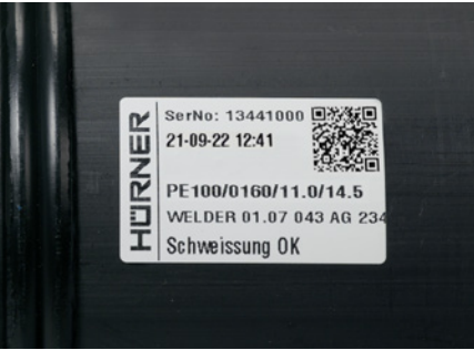
Tag printer and label tags

Immediate quality labeling of every welded joint is possible with the optional dedicated tag printer that delivers an abrasion-proof plastic sticker which can be used as a label on the fitting or joint.