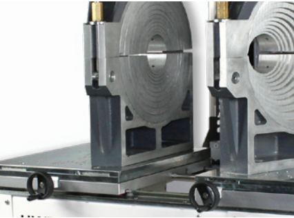
Horizontal adjustability of both carriages