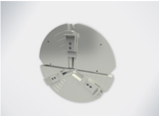
Welding neck support (two-piece)