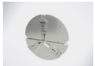
Welding neck support (two-piece)